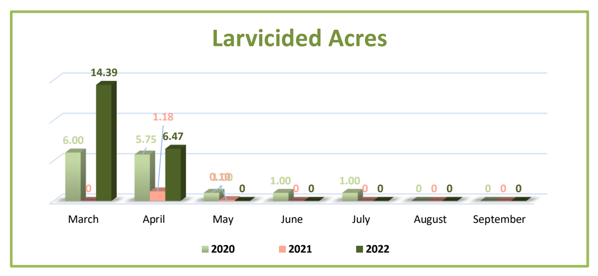
Graph 4 Acres Larvicided